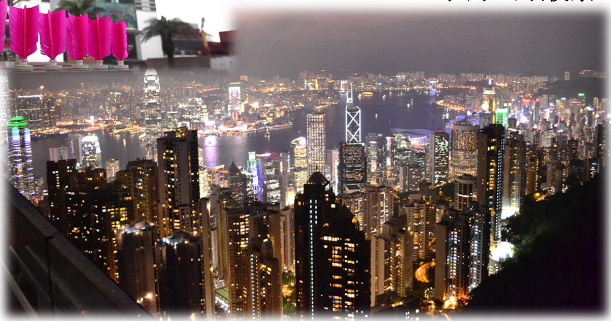
Night view from The Peak 太平山頂夜景