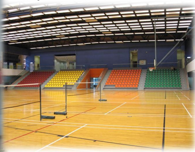
Lai Chi Kok Park 荔枝角公園