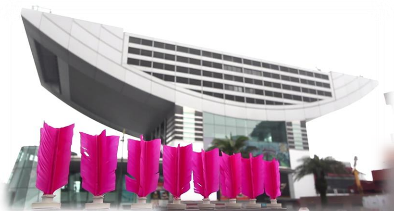
The Peak Tower 山頂凌霄閣

大會將於二零一七年七月廿二日安排遊覽香港名勝景點太平山頂。太平山頂是香港首屈一指的旅遊名勝，儘管您已經看過世上其他都市的夜景、但您在香港一定要去太平山頂！站在太平山頂上居高臨下，您就像橫越維多利亞港的上空，香港市區維港兩岸的九龍半島、香港島北岸，一一展現在您的眼前。香港是全球人口密度最高的城市之一，一幢幢摩天大樓筆直的聳立著，山下無數座大樓都同時亮起燈時，維港的海面和上空都被映照得發紫，景色壯麗璀璨。