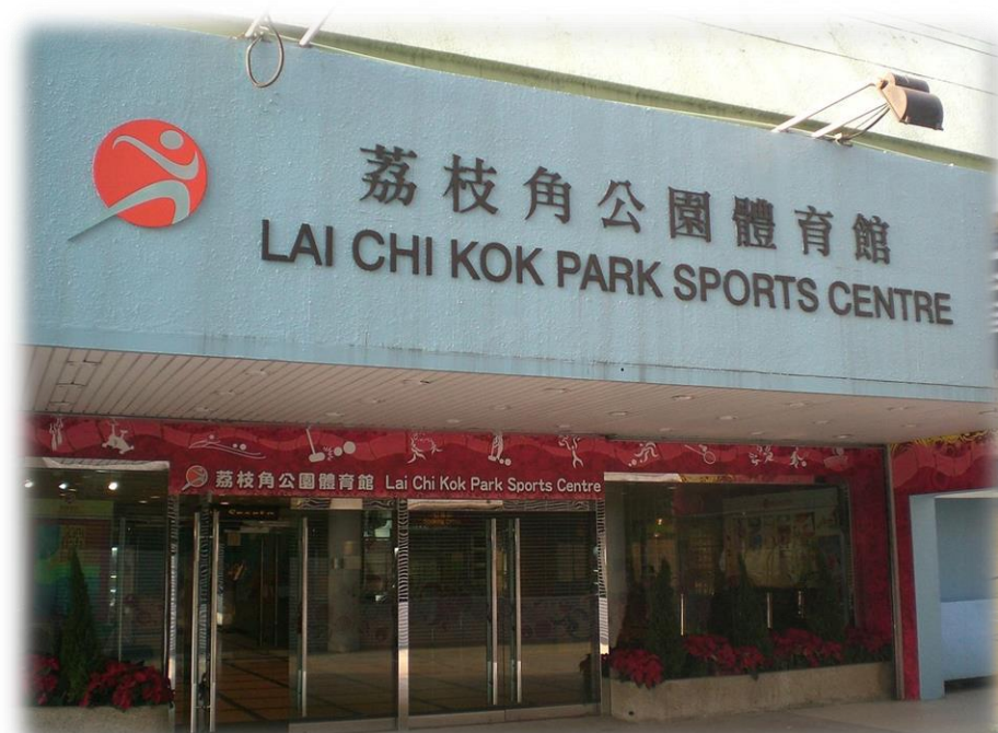
The Sports Centre 體育館場地

荔枝角公園體育館，位於香港荔枝角公園內之室內體育場館，由康樂及文化事務署管理。體育館可提供8個足毬場地，同時可容納超過300人的看台，配備空調設施。場館也擁有多個多用途房間，適合舉辦大型足毬賽事。體育館外亦有公園及休憩設施，而且鄰近市區，方便市民觀賞賽事。